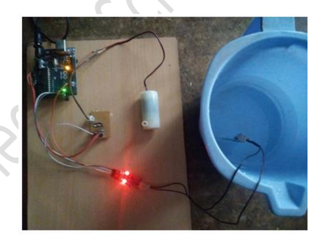
Fig.3.2. Output results.